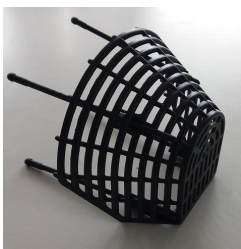
Art.44 Leaf Grate