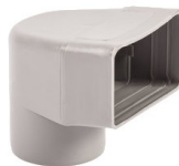
Art.47 Reducer 65x100 to 100 D/P Ø