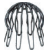
Art. 26 (in stock) Suitable for roof drains for mm. 75 Ø to mm. 125 Ø